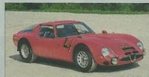
...or a super-rare car such as this Alfa Romeo TZ