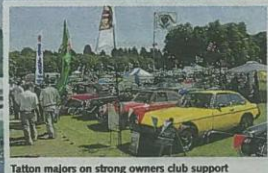
Tatton majors on strong owners club support

biggest and most unusual events that are about to hit the classic car circuit